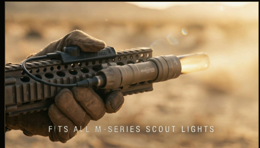
Field-use scene — Scout Light compatibility

Let's turn your product photos into a launch film that sells.